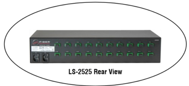
LS-2525 Rear View