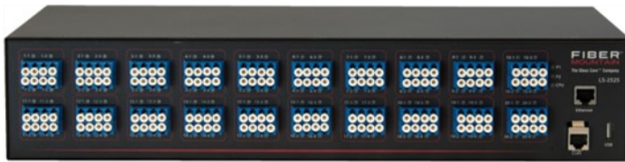
LS-2525 Front View

Fiber Mountain's LS-2525 Fiber Port Aggregator (FPA) provides single mode fiber breakout and aggregation with interactive per-port LED control for a wide range of networking devices, simplifying installation and maintenance of increasingly dense fiber networks. It provides LED indicators for each port, which can be controlled remotely via Fiber Mountain's AllPath Director (APD) orchestration software. Occupying only 2 RU, the LS-2525 FPA can break out or aggregate eighty (80) Duplex LC interfaces with twenty (20) MPO-8 interfaces, with direct port mapping and per-port LEDs.