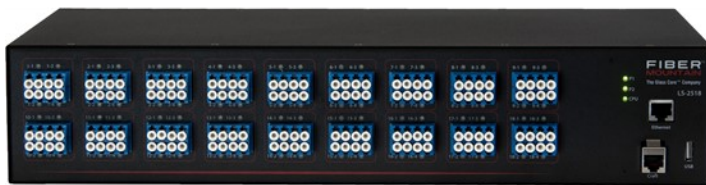
LS-2518 Front View

Fiber Mountain's LS-2518 Fiber Port Aggregator (FPA) provides single mode fiber breakout and aggregation with interactive per-port LED control for a wide range of networking devices, simplifying installation and maintenance of increasingly dense fiber networks. It provides LED indicators for each port, which can be controlled remotely via Fiber Mountain's AllPath Director (APD) orchestration software. Occupying only 2 RU, the LS-2518 FPA can break out or aggregate seventy-two (72) Duplex LC interfaces with eighteen (18) MPO-8 interfaces, with direct port mapping and per-port LEDs.