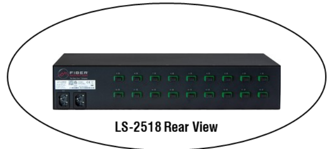
LS-2518 Rear View