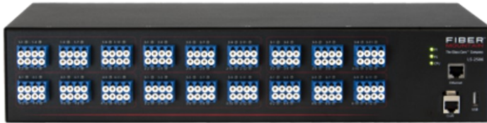
LS-2506 Front View

Fiber Mountain's LS-2506 Fiber Port Aggregator (FPA) provides single mode fiber breakout and aggregation with interactive per-port LED control for a wide range of networking devices, simplifying installation and maintenance of increasingly dense fiber networks. It provides LED indicators for each port, which can be controlled remotely via Fiber Mountain's AllPath Director (APD) orchestration software. Occupying only 2 RU, the LS-2506 FPA can break out or aggregate seventy-two (72) Duplex LC interfaces with six (6) MPO-24 interfaces, with direct port mapping and per-port LEDs.