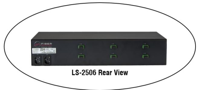
LS-2506 Rear View