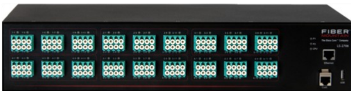
LS-2706 Front View

Fiber Mountain's LS-2706 Fiber Port Aggregator (FPA) provides multimode fiber breakout and aggregation with interactive per-port LED control for a wide range of networking devices, simplifying installation and maintenance of increasingly dense fiber networks. It provides LED indicators for each port, which can be controlled remotely via Fiber Mountain's AllPath Director (APD) orchestration software. Occupying only 2 RU, the LS-2706 FPA can break out or aggregate seventy-two (72) Duplex LC interfaces with six (6) MPO-24 interfaces, with direct port mapping and per-port LEDs.