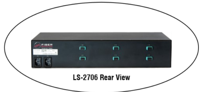
LS-2706 Rear View